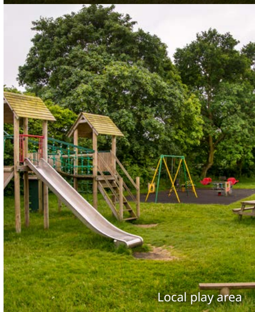
Local play area