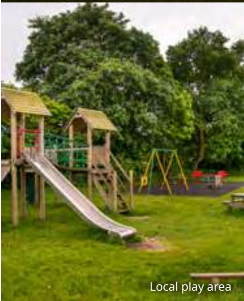
Local play area