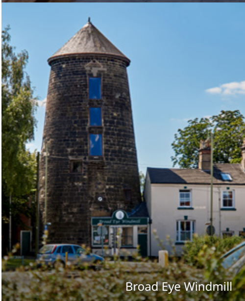
Broad Eye Windmill