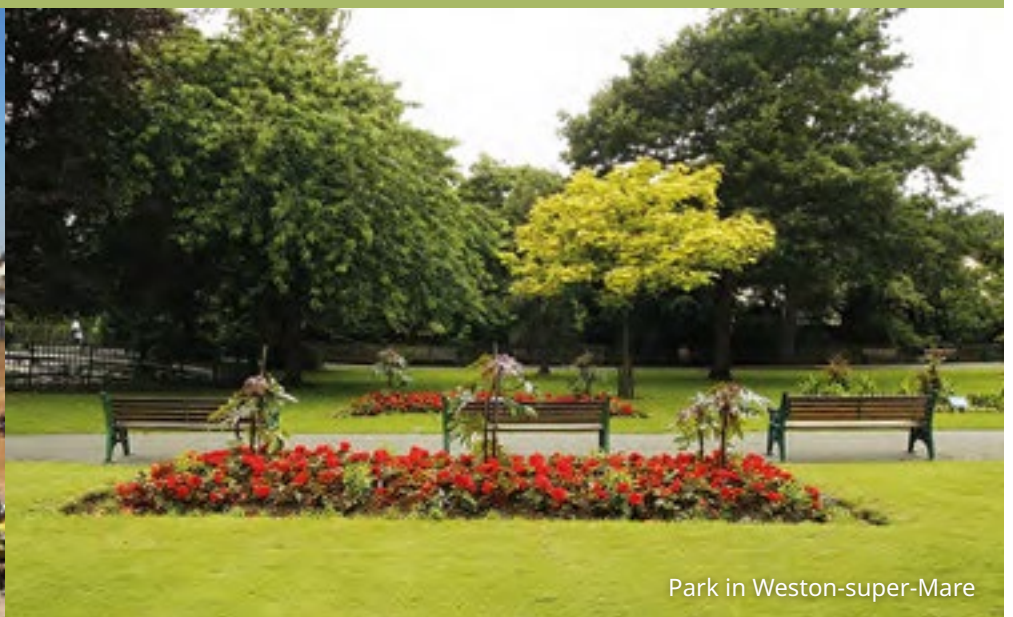
Park in Weston-super-Mare