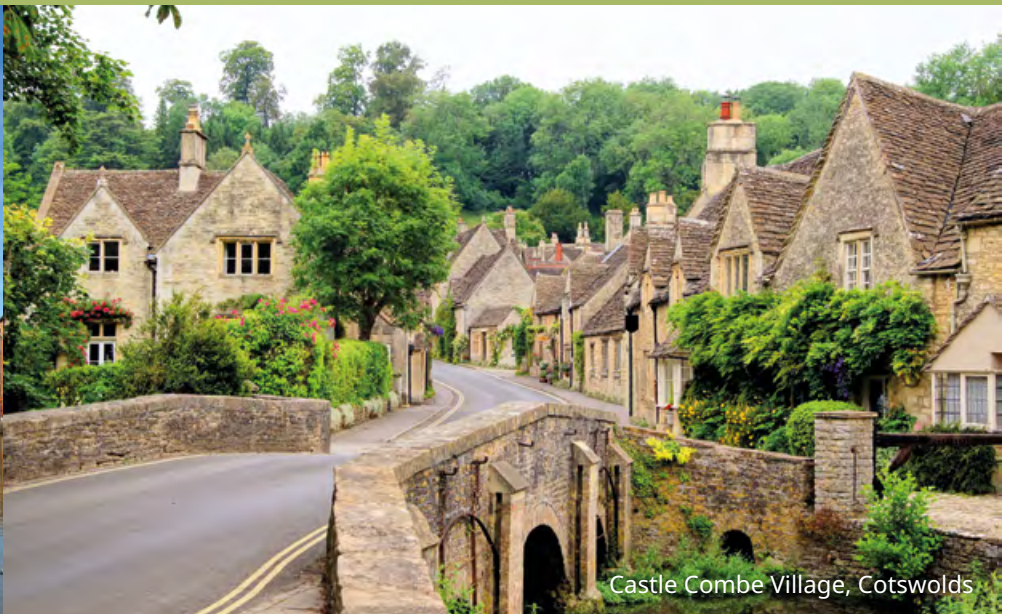
Castle Combe Village, Cotswolds