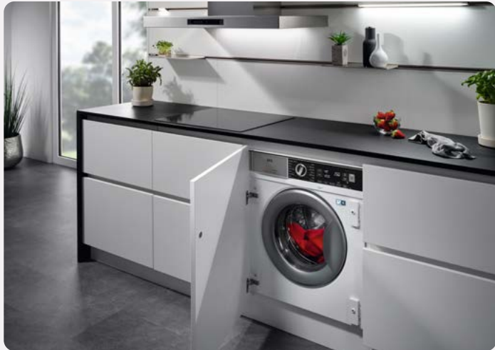
Options availability is subject to build stage of plots and options won't be available if plots have reached a certain build stage. Please contact the Sales Executive for further information.