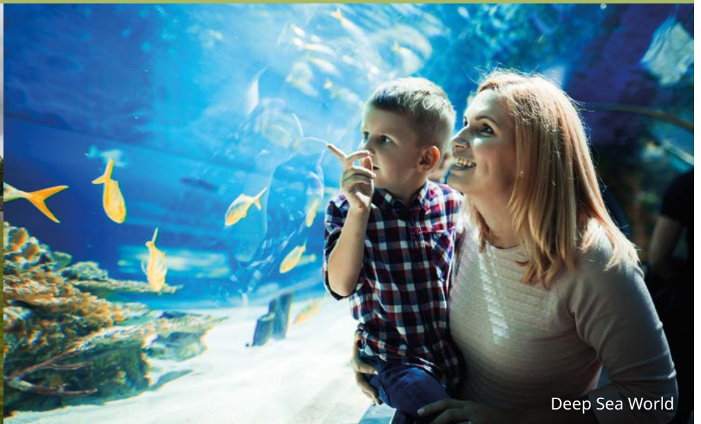
Deep Sea World