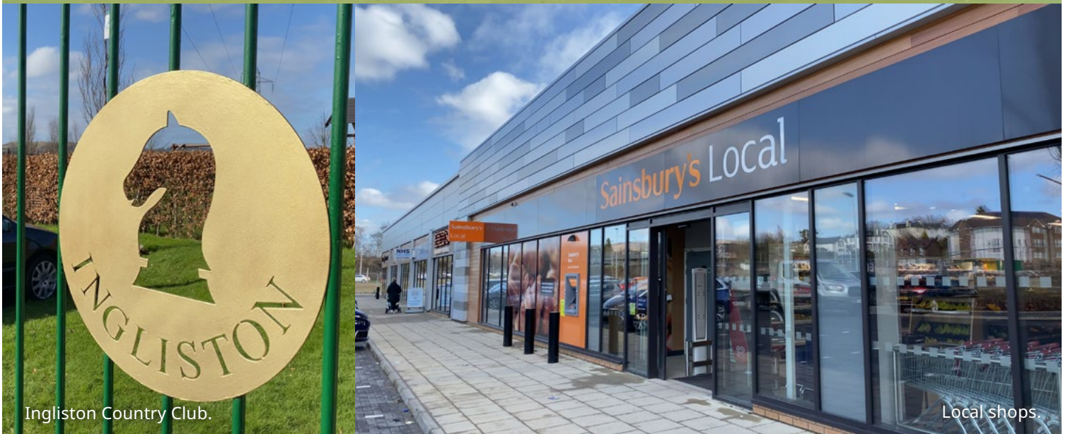
Ingliston Country Club.