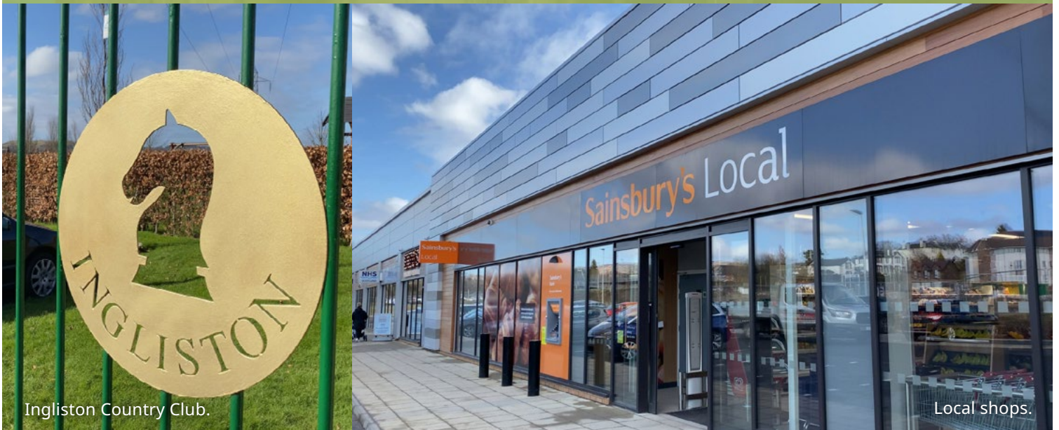
Ingliston Country Club.