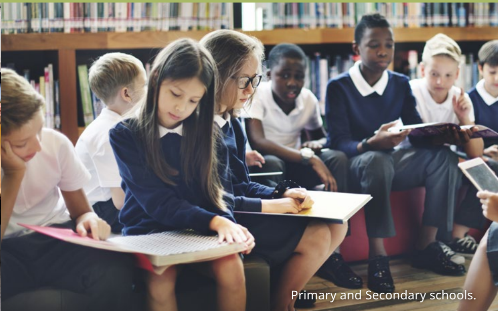
Primary and Secondary schools.