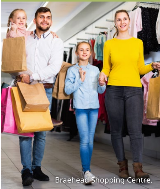
Braehead Shopping Centre.