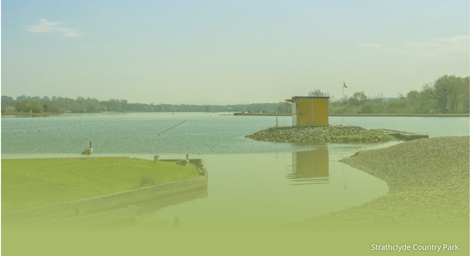
Strathclyde Country Park.

Of course, home life is only part of the story. You'll want stress-free links to other parts of the country too. Fortunately, Newton Farm boasts easy access to the M74, M8 and M73 motorways, and with Newton train station within walking distance, which can take you into Glasgow Central in under 20 minutes, this is the ideal location for commuters.