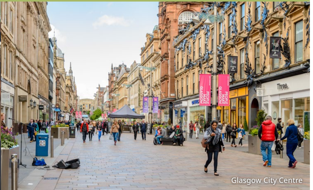
Glasgow City Centre