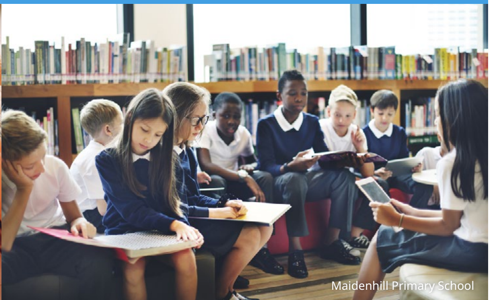
Maidenhill Primary School