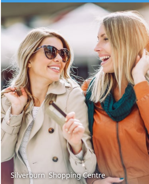
Silverburn Shopping Centre