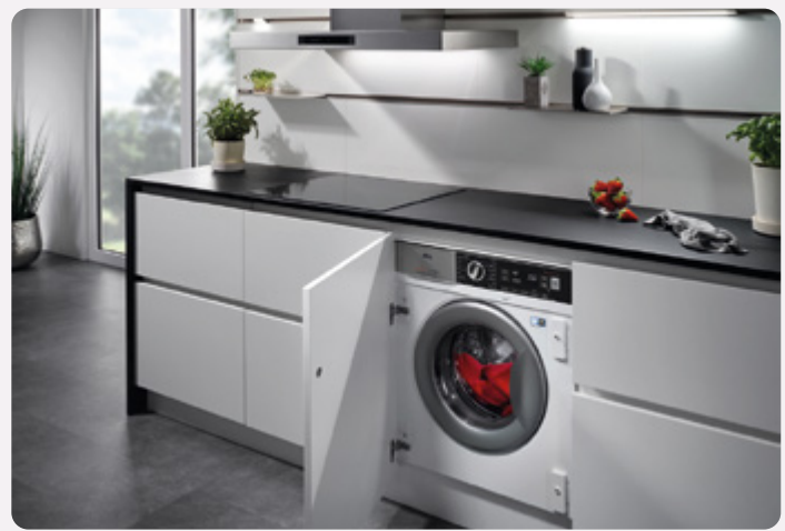
Options availability is subject to build stage of plots and options won't be available if plots have reached a certain build stage. Please contact the Sales Executive for further information.