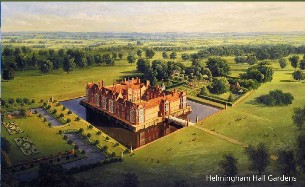
Helmingham Hall Gardens