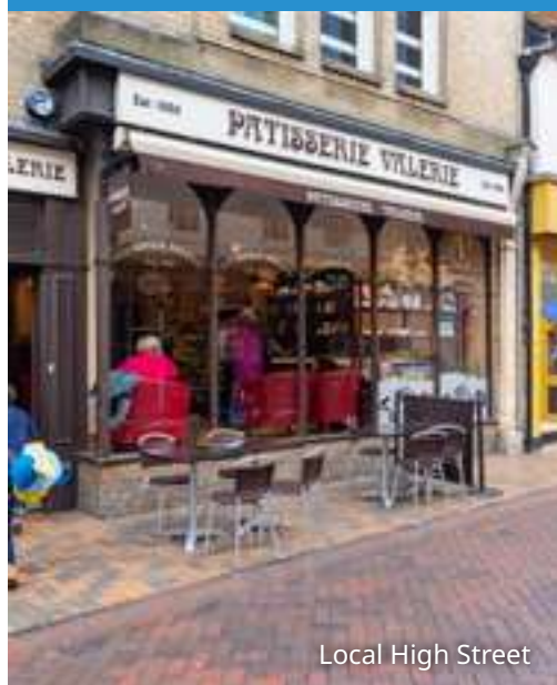
Local High Street