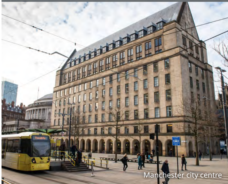
Manchester city centre