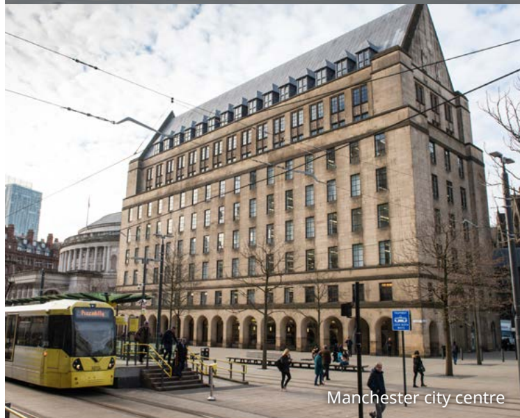
Manchester city centre