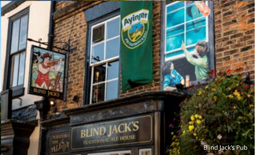
Blind Jack's Pub