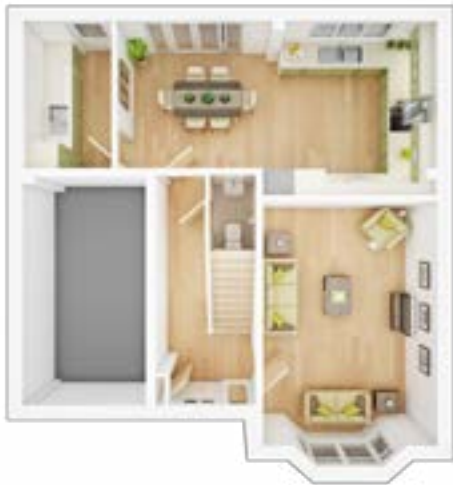
3D cutaway floor plan