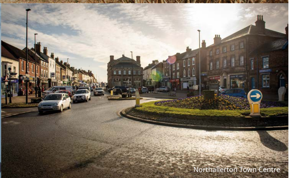
Northallerton Town Centre