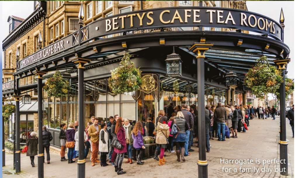
Harrogate is perfect for a family day out