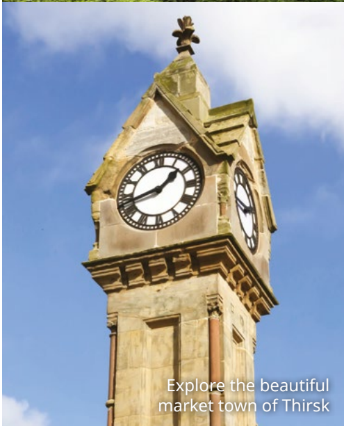
Explore the beautiful market town of Thirsk