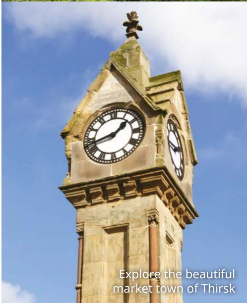
Explore the beautiful market town of Thirsk