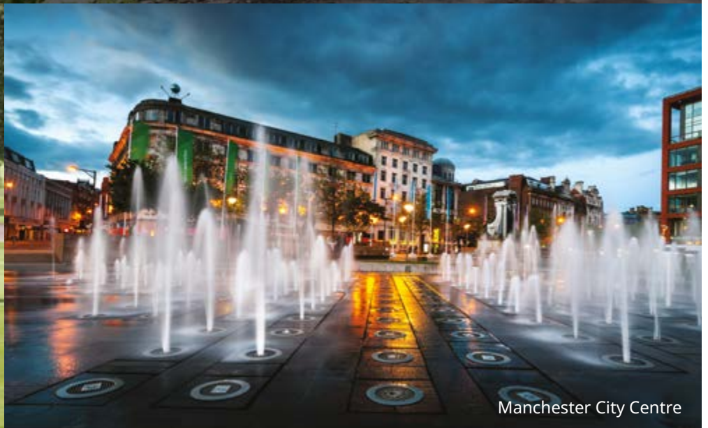
Manchester City Centre