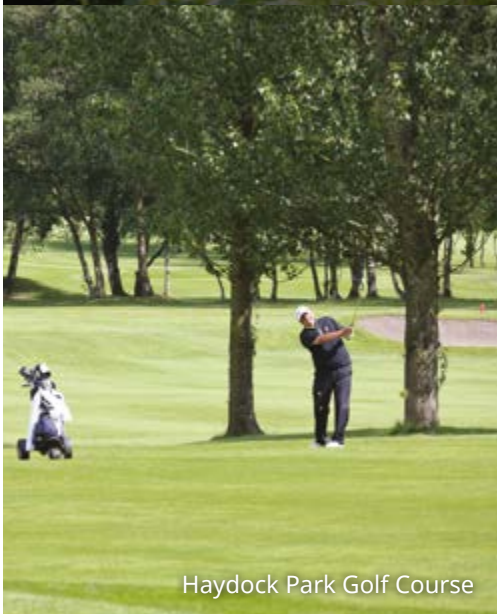
Haydock Park Golf Course

Rothwells Farm is the perfect location for modern family life. Golborne offers all of the amenities you would expect close to hand, including a supermarket, post office, convenience store, bakers, butchers and more, along with a choice of local schools. For evenings out with friends and family, the cosmopolitan cities of Manchester and Liverpool are less than 20 miles away each, with both Wigan and Warrington also easily accessible.