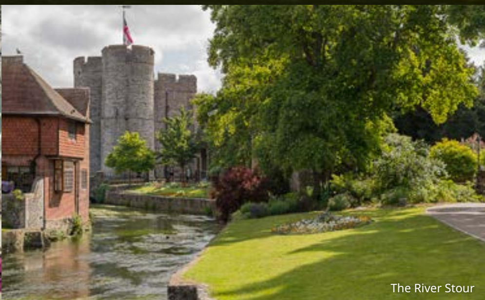
The River Stour