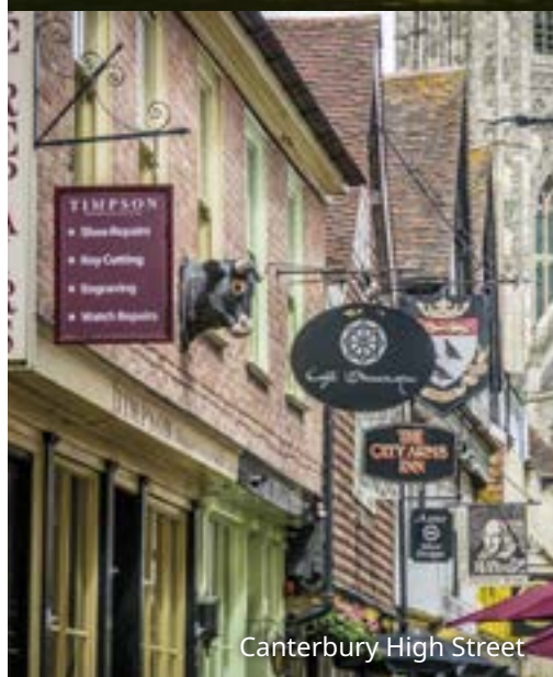
Canterbury High Street