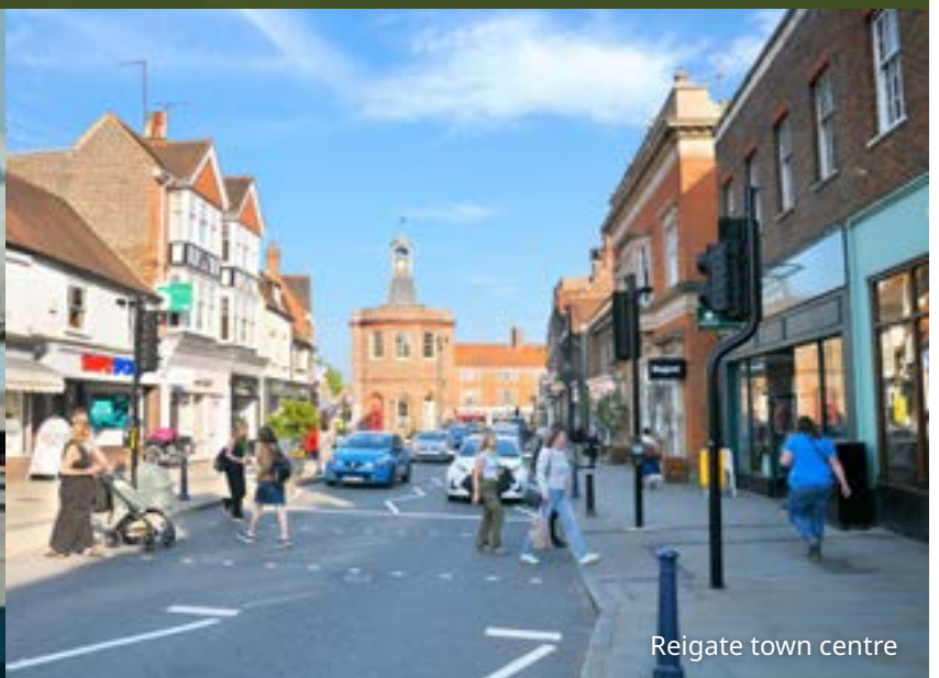
Reigate town centre