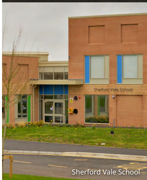
Sherford Vale School

Sherford is more than just a new housing development, it is a new community where residents can enjoy having everything they need right on their doorstep.