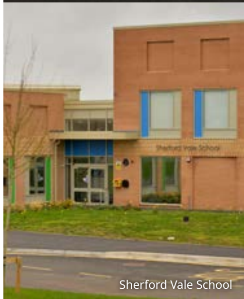
Sherford Vale School

Sherford is more than just a new housing development, it is a new community where residents can enjoy having everything they need right on their doorstep.