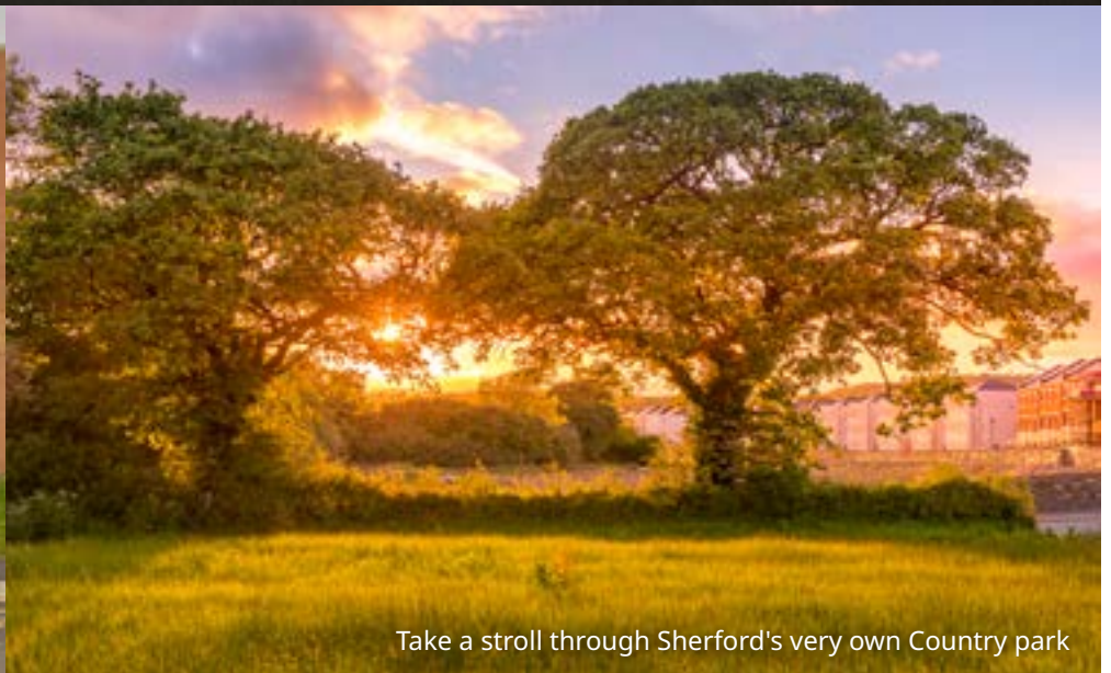
Take a stroll through Sherford's very own Country park