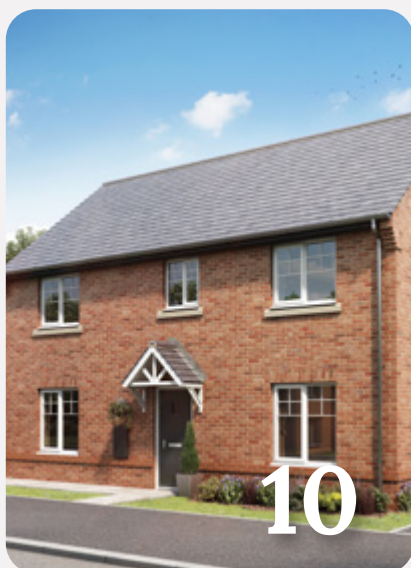
4 bedroom homes