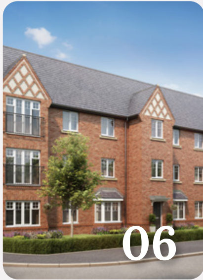
2 bedroom homes