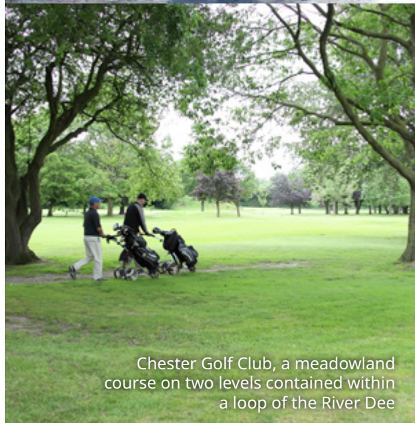
Chester Golf Club, a meadowland course on two levels contained within a loop of the River Dee