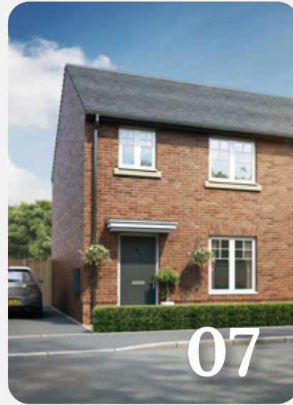
3 bedroom homes