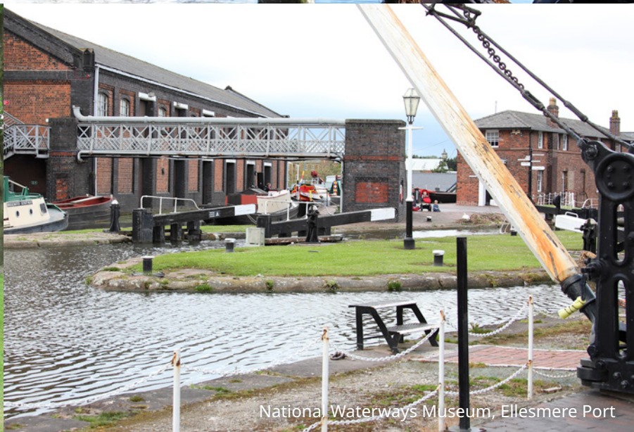
National Waterways Museum, Ellesmere Port