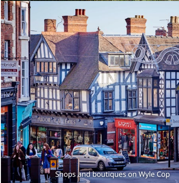
Shops and boutiques on Wyle Cop