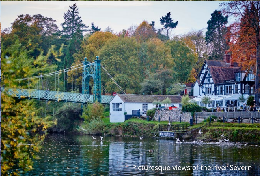
Picturesque views of the river Severn