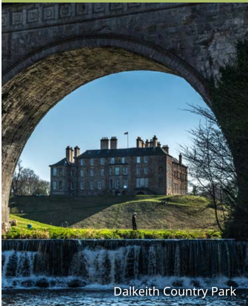
Dalkeith Country Park