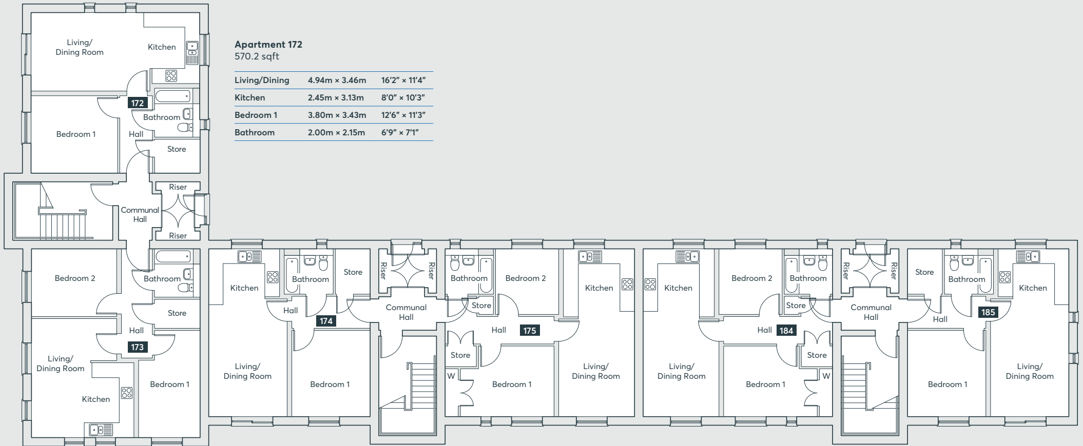
Apartment 172 570.2 sqft