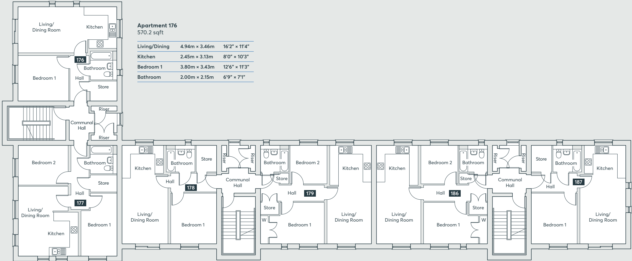
Apartment 176 570.2 sqft