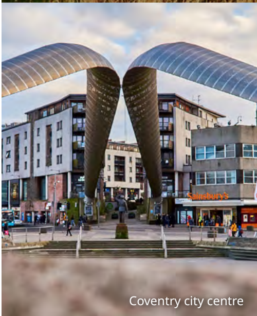
Coventry city centre