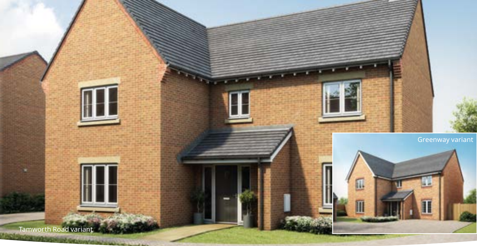
Tamworth Road variant