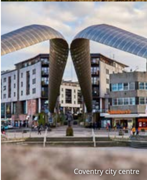
Coventry city centre