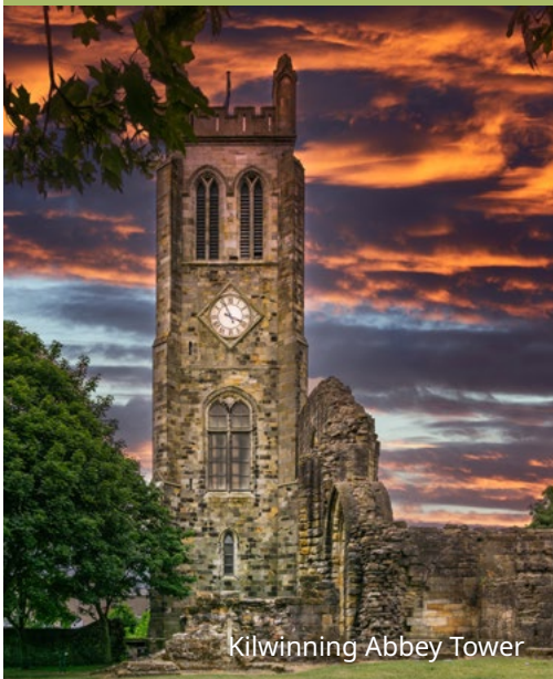
Kilwinning Abbey Tower