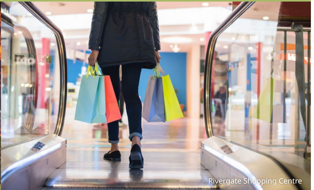
Rivergate Shopping Centre