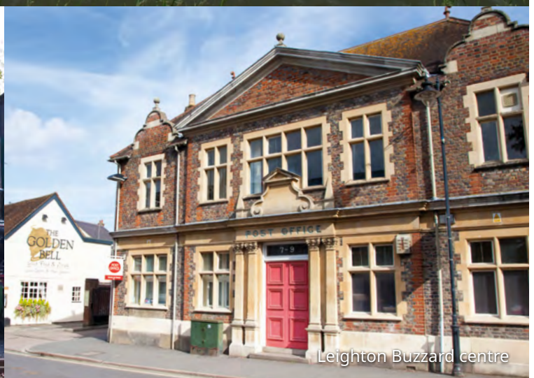
Leighton Buzzard centre