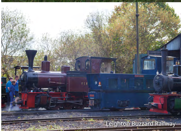
Leighton Buzzard Railway