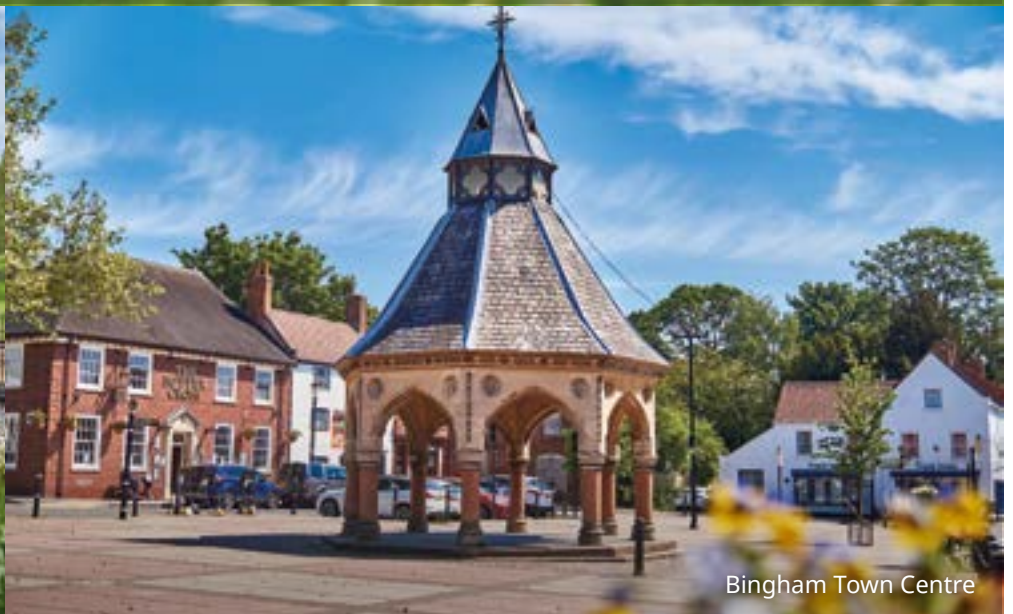
Bingham Town Centre