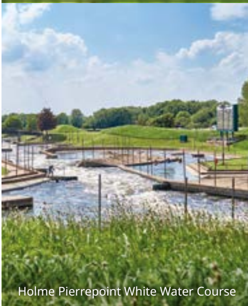
Holme Pierrepont White Water Course