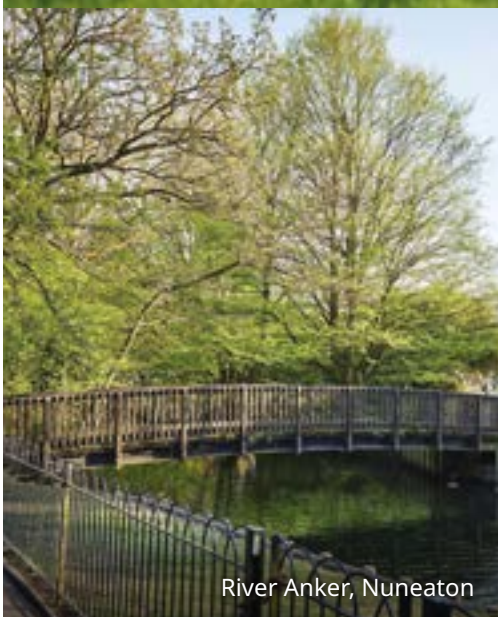
River Anker, Nuneaton

Spend time together in Warwickshire countryside