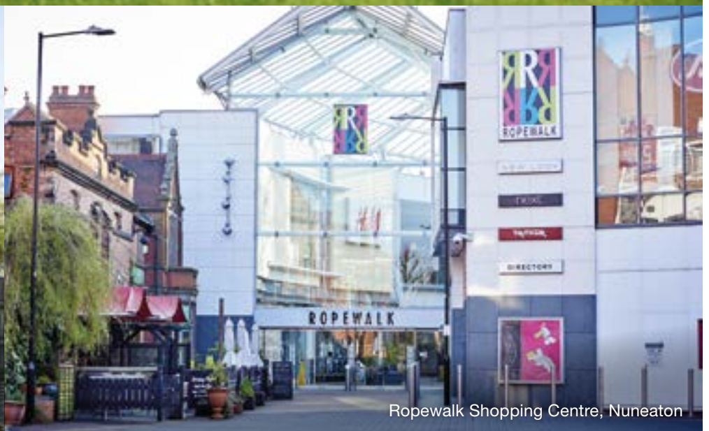
Ropewalk Shopping Centre, Nuneaton