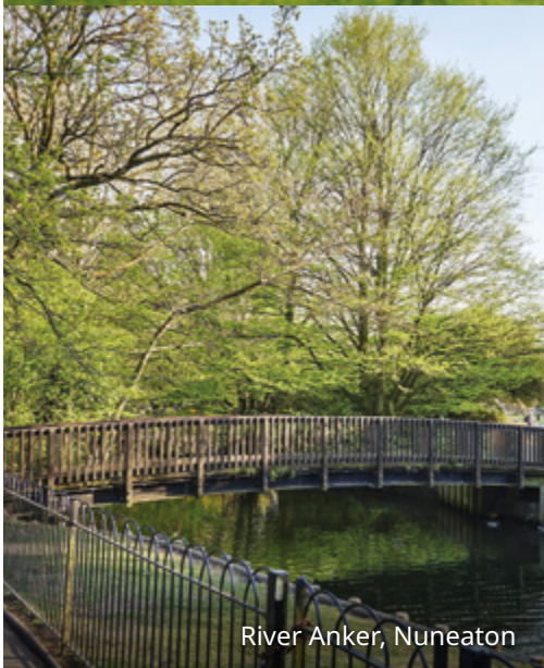
River Anker, Nuneaton

Spend time together in Warwickshire countryside