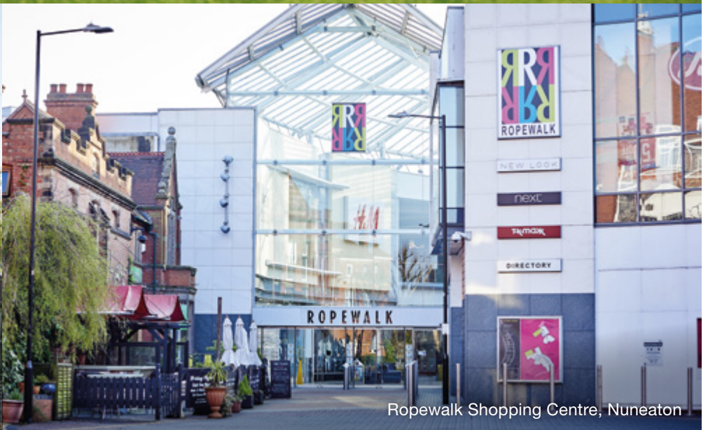
Ropewalk Shopping Centre, Nuneaton