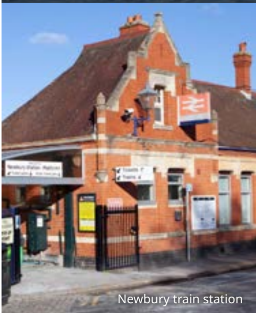
Newbury train station