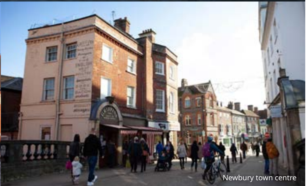
Newbury town centre

Travel times taken from google.co.uk/maps and nationalrail.co.uk and are approximate only.