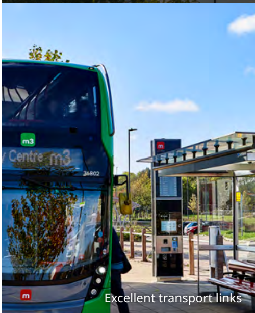
Excellent transport links