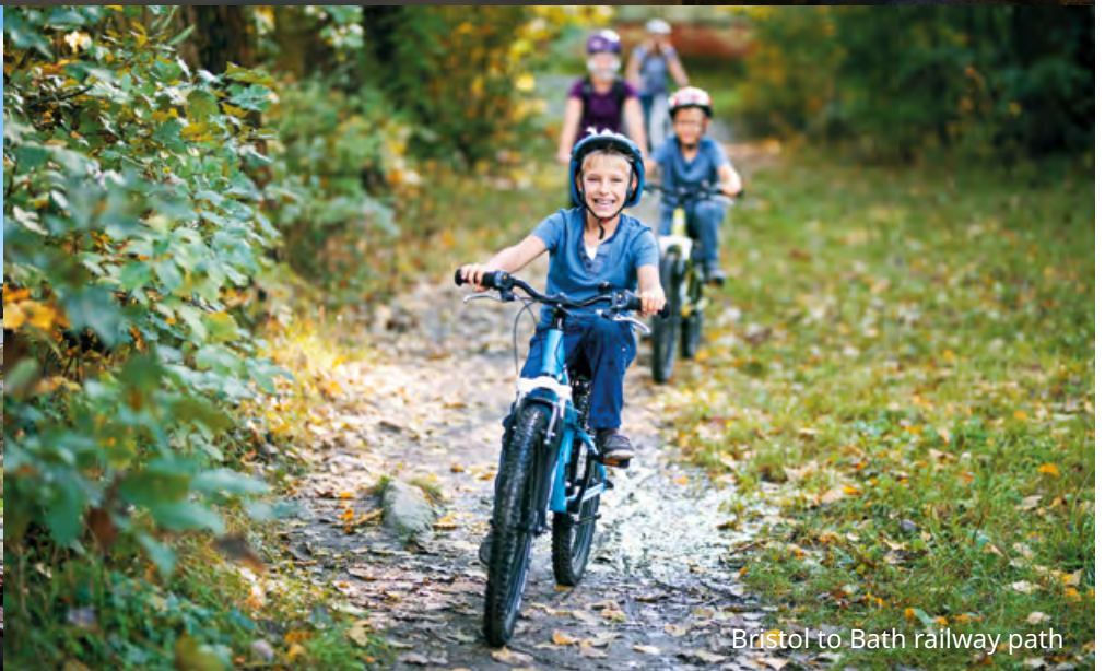
Bristol to Bath railway path