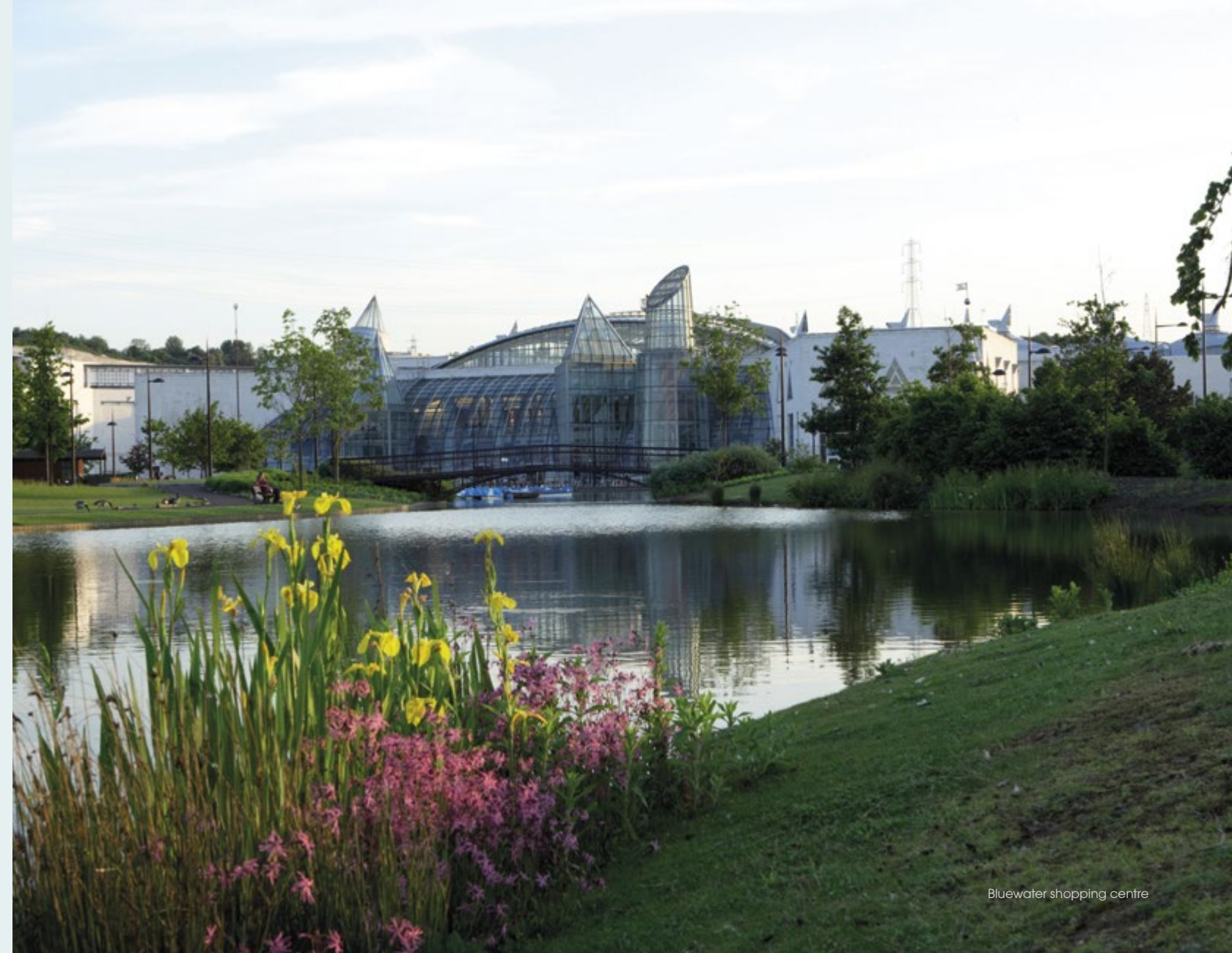
Bluewater shopping centre