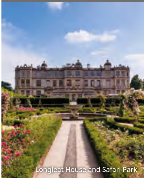
Longleat House and Safari Park