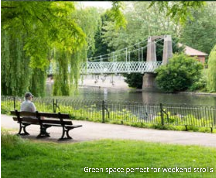
Green space perfect for weekend strolls

Nature lovers will be spoilt for choice, with Whipsnade Zoo, Woburn Safari Park and the beautiful Barton Hills Nature Reserve all close to home. For those looking for big city entertainment, London is less than 30 minutes away by train.