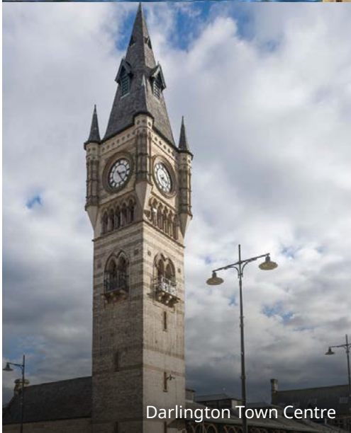
Darlington Town Centre