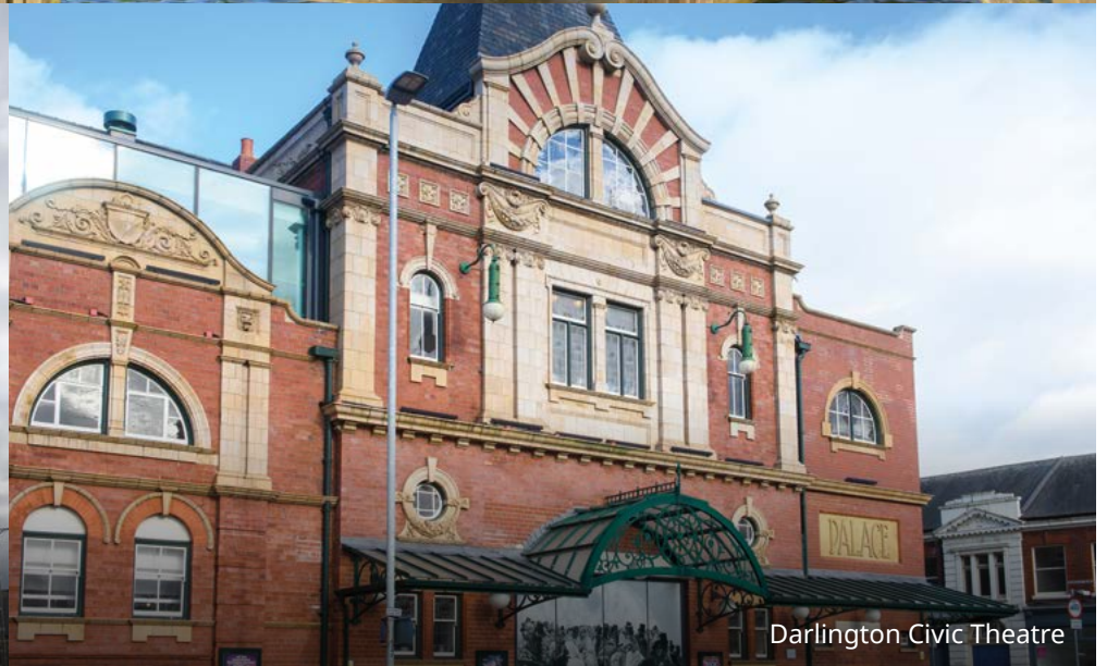
Darlington Civic Theatre