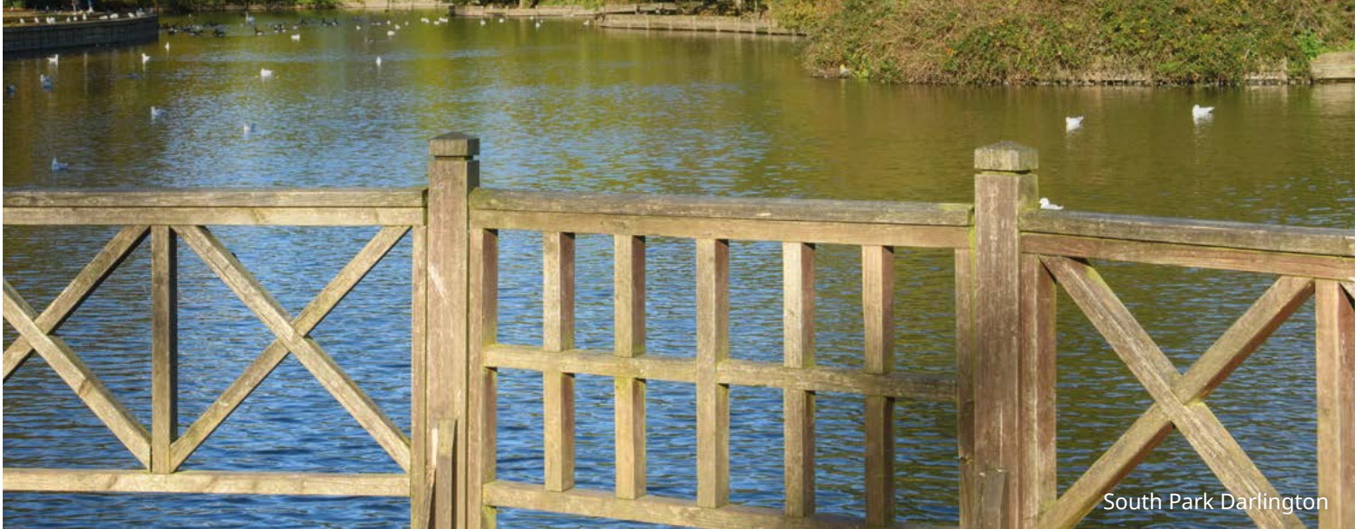
South Park Darlington

South Park is close by, where you can often listen to free outdoor concerts, enjoy the flowerbeds, see exotic birds in the aviary or play your favourite sport in the multi-use games area.