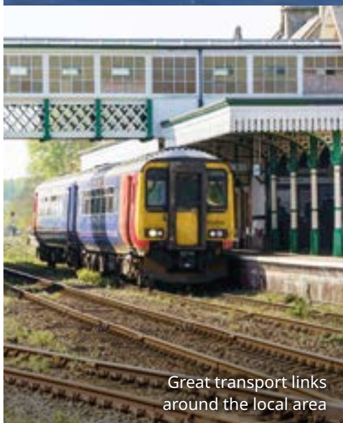
Great transport links around the local area

Riverside Walkway Country Park, Sleaford