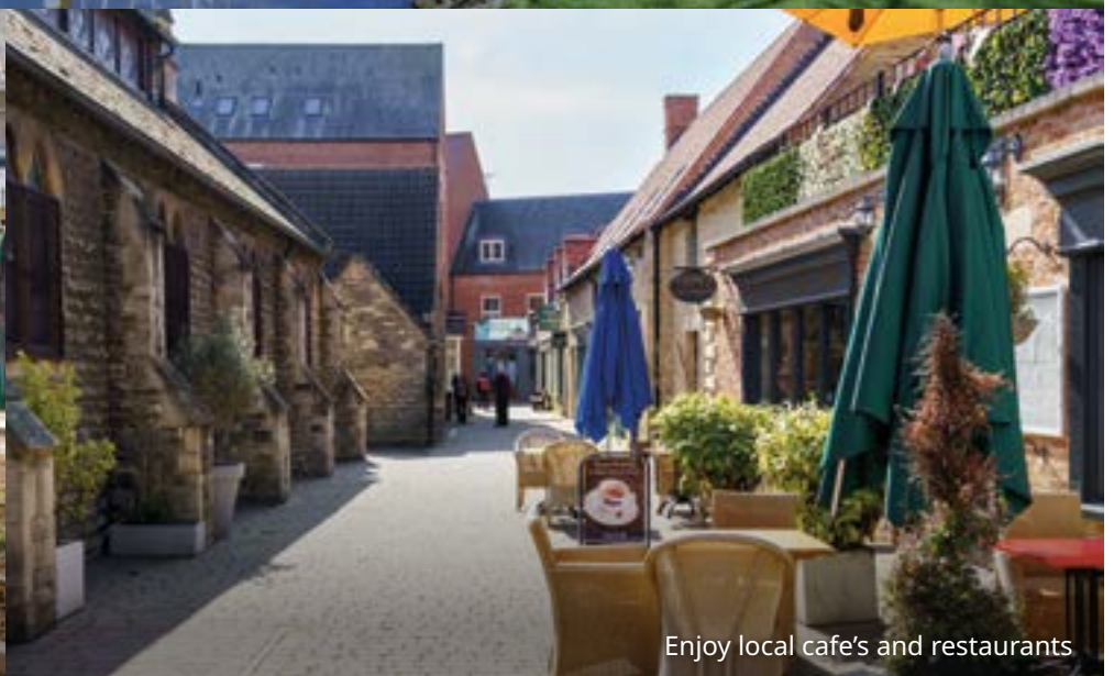
Enjoy local cafe's and restaurants