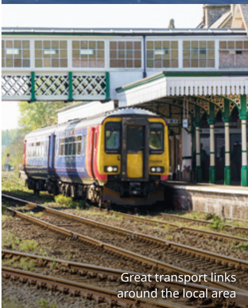
Great transport links around the local area

Riverside Walkway Country Park, Sleaford