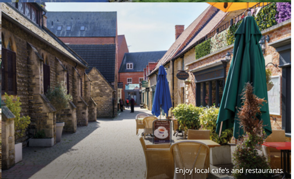
Enjoy local cafe's and restaurants