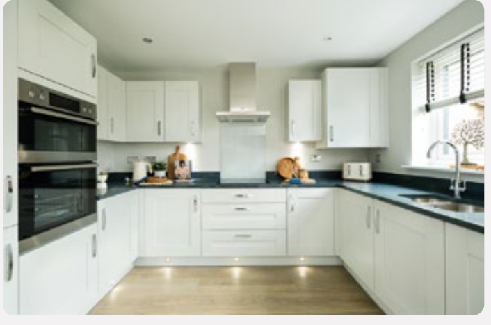
Options availability is subject to build stage of plots and options won't be available if plots have reached a certain build stage. Please contact your Sales Executive for further information.