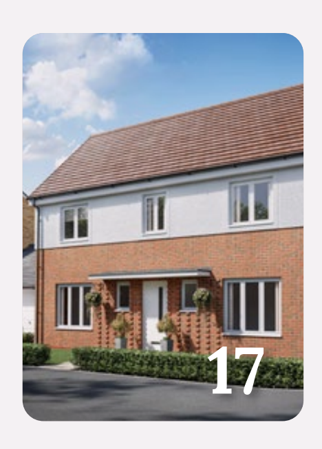
5 bedroom homes