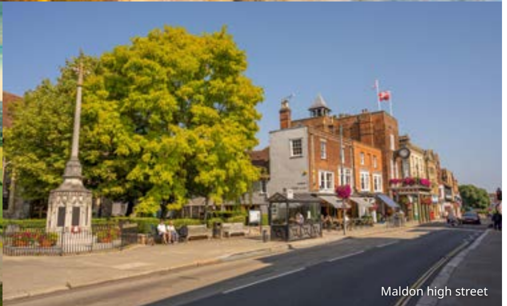
Maldon high street