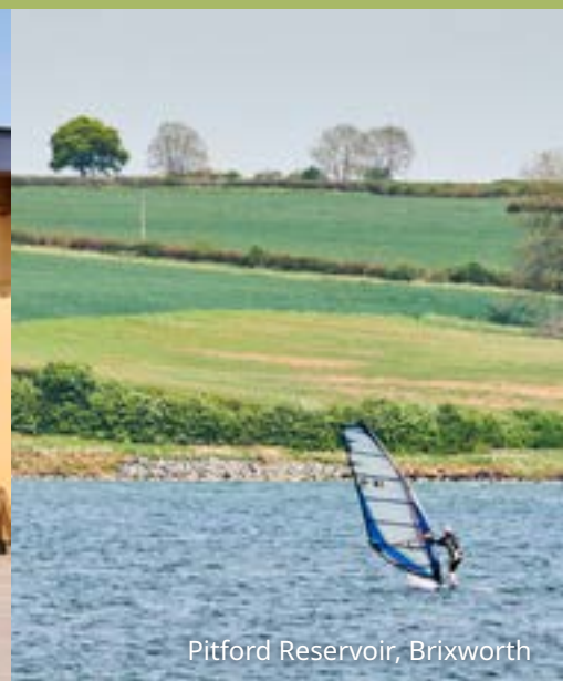
Pitford Reservoir, Brixworth