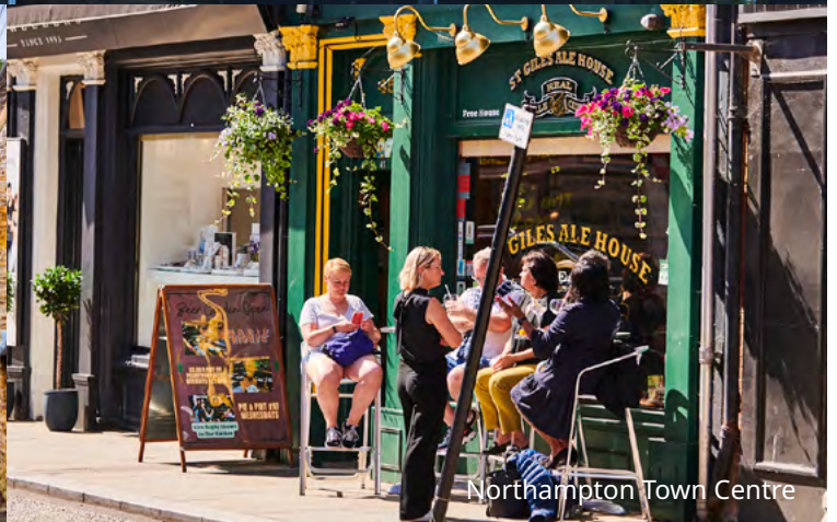
Northampton Town Centre